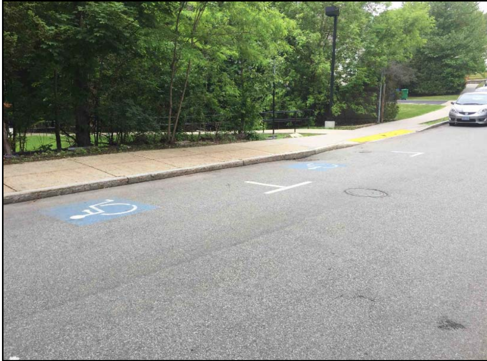
Curb cut near accessible parking spaces, Hull Street