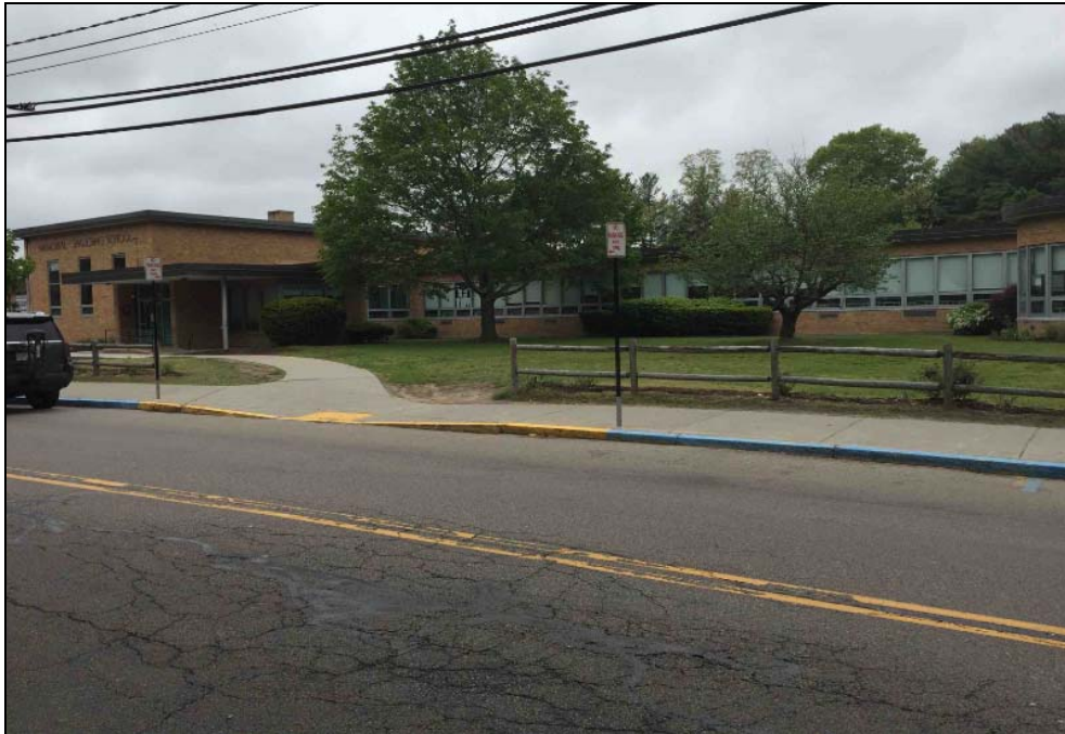
Curb cut on Brookline Street near Memorial Spaulding School