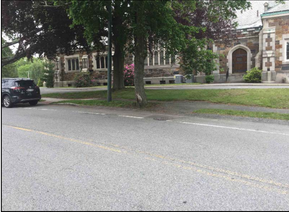
Curb cut on Homer Street opposite Furber Lane