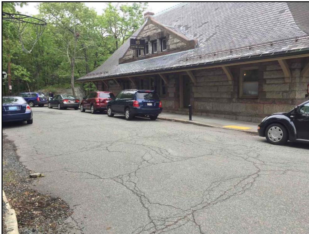
Curb cut at 18 Station Avenue