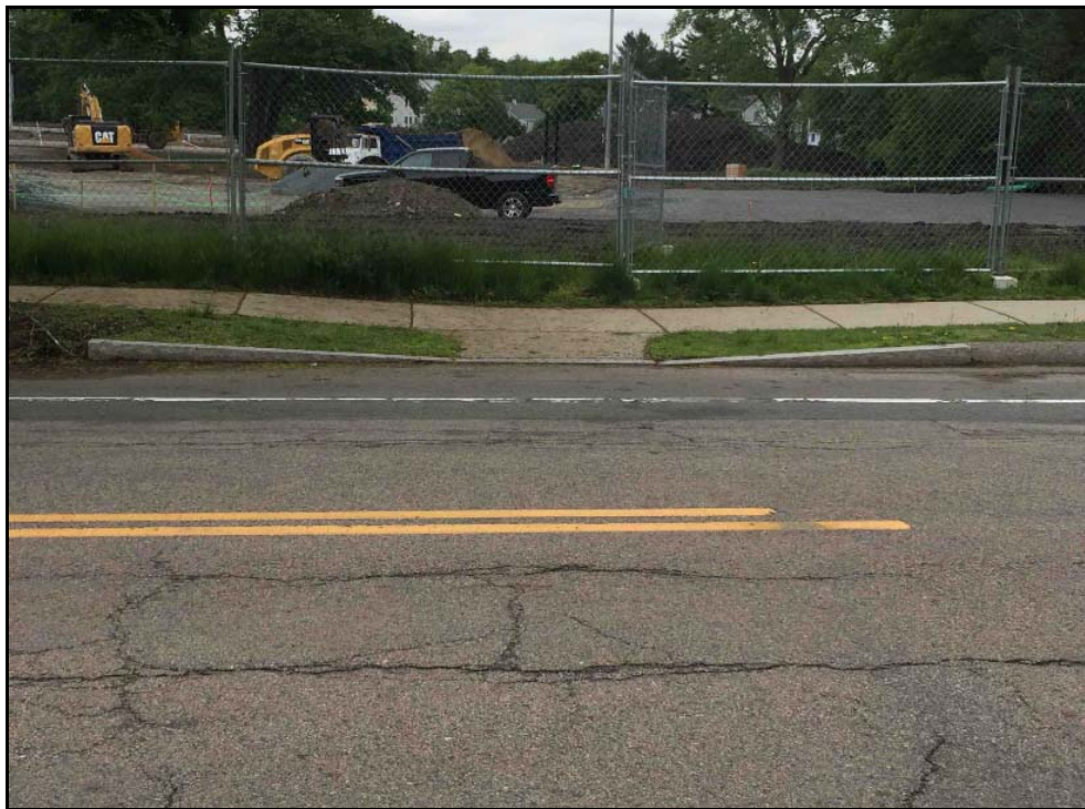
Curb cut on Dedham Street across from Brierfield Road