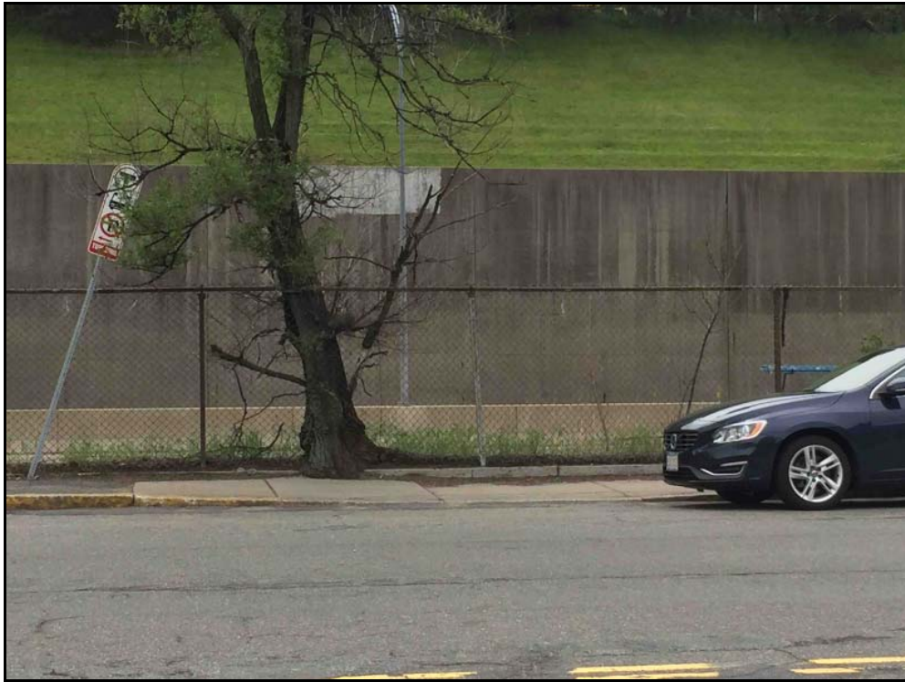
Curb cut at a MBTA Bus Stop, Washington Street at Armory Street