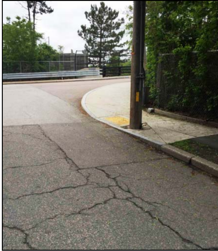
Curb cut not quite at a corner, Farquhar Street near Harvard Street